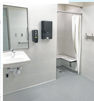
Private Changing Rooms