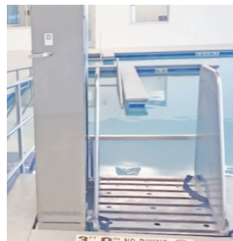
Hydraulic Wheelchair Lift